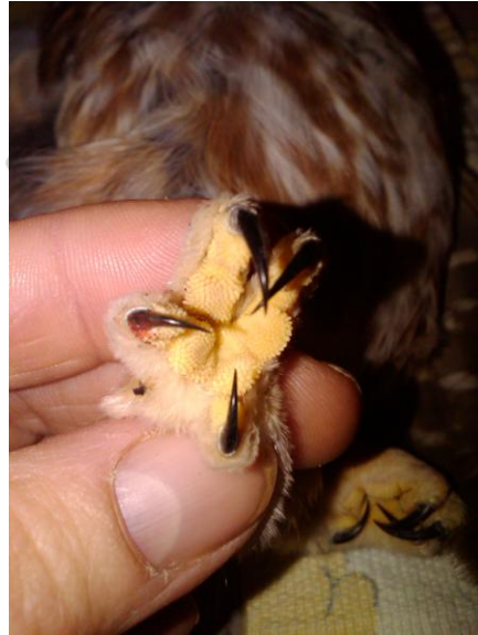
Foot Number One

Just for fun, we have three photos of feet from three different raptors. Can you guess what species they belong to? Answers are found on the last page.