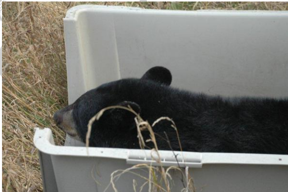
Black bear gets her bearings during release.