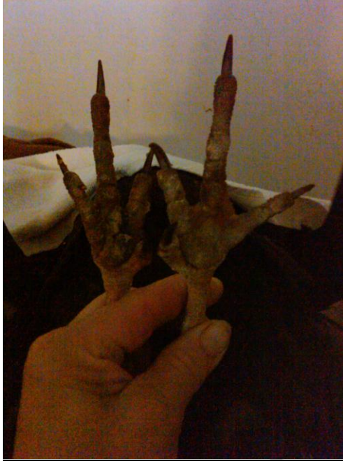
Foot Number 3