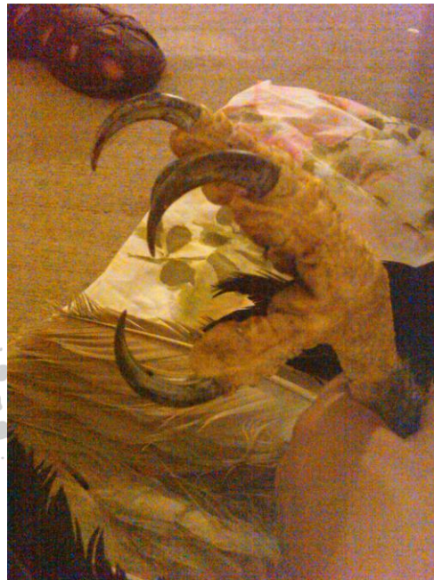
Foot Number Two